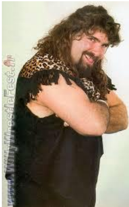
Cactus Jack

wrestled in many smaller promotions and in Japan. Not only is he a wrestling superstar, he is also a best-selling author, a TV personality, and a stand-up comedian. He is married and has children. So what makes this all around entrepreneur want to become known as a hardcore legend? It is simple the response and the reactions from the fans.