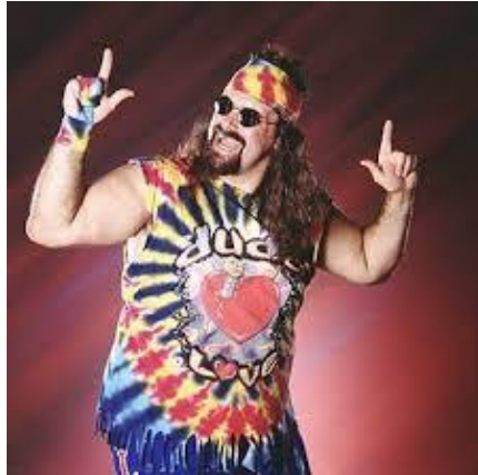
Dude Love

Dude Love was actually Mick Foley's first creation when he first started on the Indy Circuit. As he say, "Dude Love was my fantasy creation of what a man was supposed to be. I never envisioned a freak like Mankind or a weirdo like Cactus Jack" (Foley, 1999, p.48). "The June 1984 Dude was quite a bit different from the dude who entered the World Wrestling Federation in 1997" (Foley, 1999, p.48). The first dude was more laid back than the tie-dyed groovy Dude Love of the World Wrestling Federation.