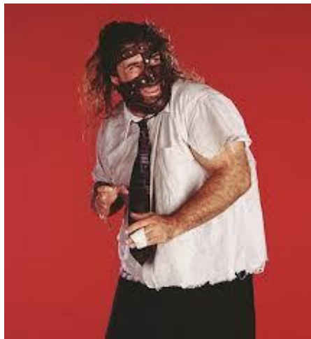
Mankind - goodmenproject.com

get these idea's out of their system" (Ognjanovic,2014,p.88). In many respects, Cactus Jack matches are a barbaric study in violence, whether as a babyface or a heel, the men and teens especially want to see the over-the-top violence that most Cactus Jack matches have.