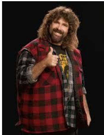
Mick Foley

of different parts of Mick Foley's personality, so his next persona took that into account and the fans got the wrestling version of Mick Foley.