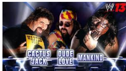
All three -W13 www.youtube.com

As with his Cactus Jack persona, the women could not stand the ultra-violence ( Cactus Jack vs Big Van Vader 4-17-1993 ). Although as time went on, Mankind’s matches became far less brutal than Cactus Jack. The men and children hated him, and their reaction was to boo him and wanted to see him lose. After a while, all the abuse that Mankind took started to wear on the fans and the response and reactions changed to where there were some boos and some cheers. This caused Mankind to go from Heel to Baby. As a baby. Though, the Mankind persona got stale and the fans just quit responding one way or the other; therefore, another Mick Foley’s personae emerged ( Mankind vs. Shawn Michaels 9-22-1996 ).